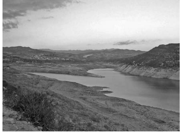
Figure 2. The Kouris River Valley from the Dam to Alassa.