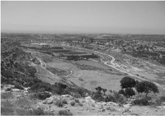
Figure 3. The lower Kouris River Valley.