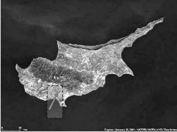
Figure 1. Satellite image of Cyprus