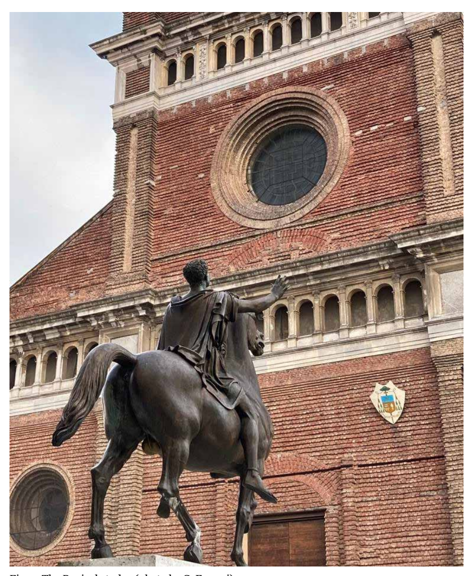
Fig. 2. The Regisole today.

Although the question has already been addressed several times – even quite recently<sup>6</sup> – I believe that it is not entirely unjustified to consider it once