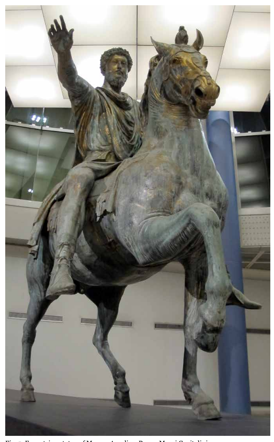
Fig.\ 5.\ Equestrian\ statue\ of\ Marcus\ Aurelius.\ Rome,\ Musei\ Capitolini.