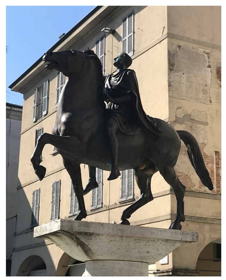
Fig. 1. The Regisole today.

in favour of the second hypothesis: in particular, I will argue that the transfer of the Regisole from Ravenna to Pavia can be attributed with some certainty to Aistulf, who carried it out in some unknown year between 751 and 756 – that is, after occupying the capital of the Exarchate and before being finally defeated by the Frankish king Pippin, who forced him to hand the city over to the Pope.