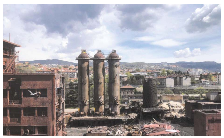
Figure 3 - The hot area of the Servola ironworks undergoing demolition (author's photo, April 2021).