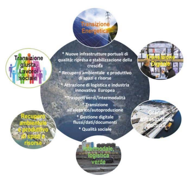
Figure 5 – Summary graph of the "Adriagateway Project" (AdSP, September 2020).

The Adriagateway Project, developed during the summer of 2020, defines a system of 57 potential actions (project components) to be implemented in the Port System, divided into 6 macro-categories and financed for 385 million Euros by the National Plan for Recovery and Resilience. For example, the electrification of the docks (cold ironing), which will reduce the impact of the generators of moored ships, which remain active during loading and unloading operations, as well as the strengthening of railway logistics, considered in terms of greater sustainability.