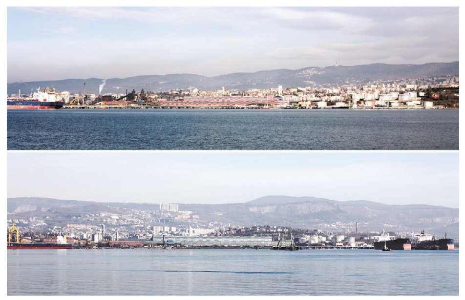
Figure 1 – Camouflage studies of the volumes of the Cold Area for the purpose of landscape mitigation (elaboration by the author, 2015).

heavily polluted industrial area, it was necessary to give up the permeability of the soils and the possibility of using mitigation elements such as tree plantings. The large squares also contribute to the formation of a "heat island" effect, typical of urbanized areas. In terms of land consumption, on the other hand, given that the soil was already compromised by pollution, the balance was unchanged from the execution of the clapping.