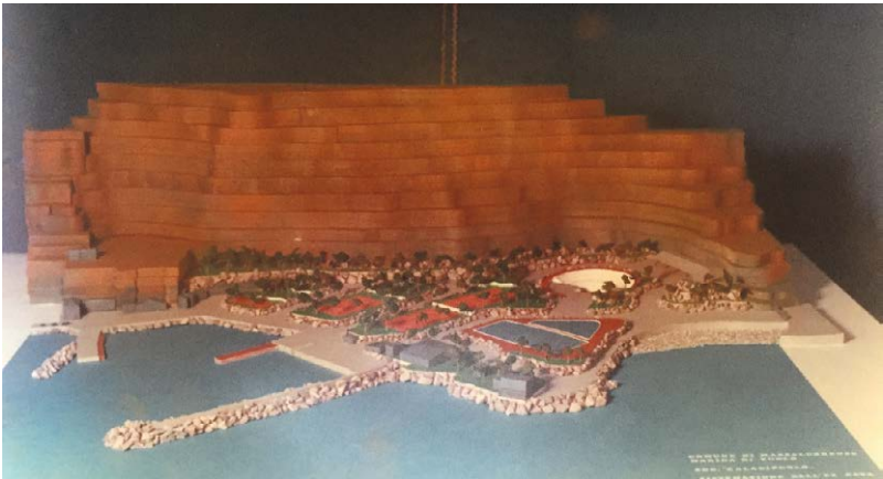
Figure 3 – Model of the tourist village project to be built in Cava Merlino area, by ACML.

Fortunately, landscape protection associations and political groups, engaged to preventing the arbitrary privatization of bay state property, while preserving the public use of the only free beach on the coast from there to Amalfi, managed to hinder the speculative project. Currently the vast esplanade of the quarry area, dug into the rocky promontory close to the bay, houses a private parking, while the piers and docks close to the beach are occupied by seasonal bathing facilities. Continuing along the coast, after the small inlet of Chianella, which housed a series of small quarries for the production of rubble, we meet the bay of Marcigliano with the opening of the Cava Vitale, since 1910 had begun to irreversibly erode the high rocky ridge. The abandoned quarry area, in the sixties of the twentieth century, as happened in many other quarry areas insistent in the bays of the coast, was converted for tourist use. A hotel complex with a bathing establishment called “Conca Azzurra” was built in the bay. The hotel of modest architectural value is spread over three floors, the adjoining parking area was built on the esplanade of the quarry, while the