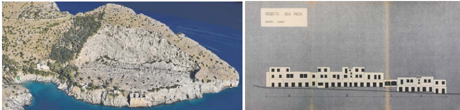
Figure 9 - 10 – Jeranto Bay, Punta Penne defaced by the Ilva quarry, in the image can be seen the remains of the buildings built for quarrying activities, Hotel le Sirenuse, statement.

In March 1977, with a deed of donation, all the land owned by Nuova Italsider in the Jeranto bay passed to the FAI (Italian Environment Found), so that the bay was definitively removed from the dangers of speculation. Over the years of FAI's management, the entire area has been the subject of major environmental restoration interventions aimed at recovering the original Mediterranean scrub. Jeranto is currently recognized as a Site of Community Interest, included in the Marine Protected Area of Punta Campanella, also appreciated for the high level of biodiversity preserved. Having rounded Punta Penne, a