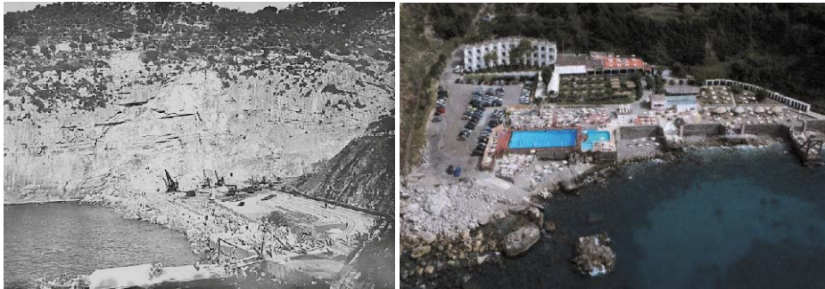
Figure 4 - 5 – Vitale quarry in the 1930s. The Conca Azzurra tourist complex at the end of the nineties.

Even the Lubrense coast was not spared by such dynamics. There are many cases of allotments authorized that then led to emblematic cases of building speculation. Meaningful episode of this new unsustainable way of occupation of the coastal territory is represented by the partition started in 1957 in the locality of Riviera San Montano 14 . The small promontory, bounded to the east by Vitale di Marcigliano quarry to the west by Marina della Lobra, at the end of the 1950s appeared as a hill sloping down to the sea, characterized by Mediterranean scrub and olive groves without houses and connecting roads 15 .