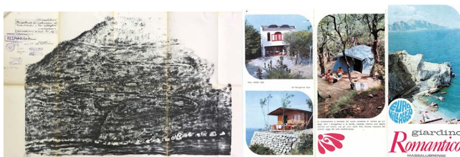
Figure 7 -8 – Project for the construction of a hotel-type tourist park Mitigliano, 1965. From ACML. Tourist poster, Giardino Romantico, 1970s.

In the bay bordered to the west by Punta San Lorenzo, in a locality called Gesiglione sul Nastro d'Oro, Guglielmo La Via on behalf of the Dutch company S.N.V. Hotel Maatshappij, realized in those years the Hotel Delfino 20 . The hotel complex built on the impervious rocky ridge overlooking the sea, still in use and recently expanded, has profoundly altered the skyline of the bay. Along the coast, another emblematic case of the conversion of a disused quarry into a tourist facility is that of the "Romantic Garden". The tourist village built by Pasquale Ricci in the Cenito quarry, insisted on a vast soil that included the two promontories that delimit the bay, to the east that of Marciano and to the west that of Punta Baccoli 21 . The tourist complex was built in one of the most evocative stretches of the Lubrense coast, on the scenic landscape of the island of Capri. Already in the early 1960s, "Il Giardino Romantico" became one of the most fashionable structures of the coast.