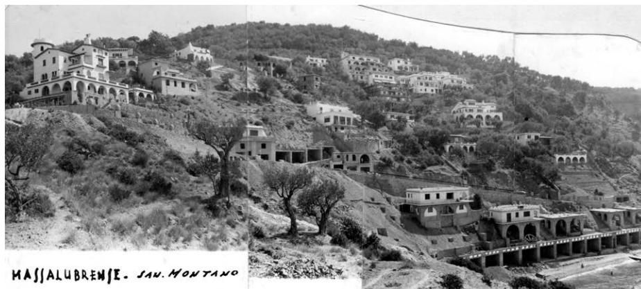
Figure 6 – The subdivision by Società Immobiliare S.P.A. on the promontory of Riviera di San Montano, the first villas under construction.