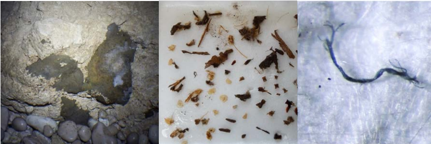
Figure 2 – Monk seal faeces (left), diet remains (center) and a fiber (right) found in faeces.

Finally, an innovative study on microplastics (Fig.3) and their additives in monk seal faeces from Zakynthos Island, eastern Ionian Sea, has been carried out [32].