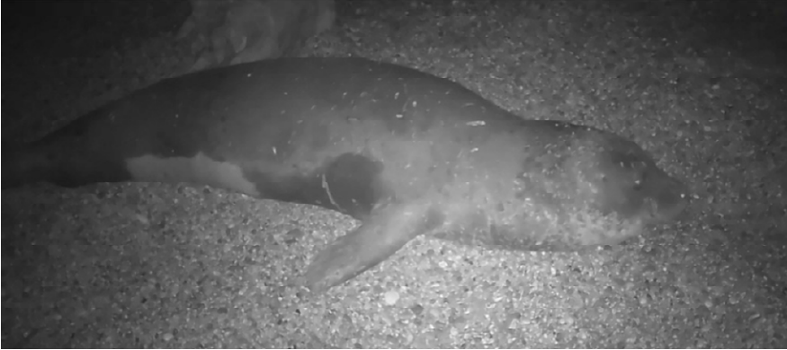
Figure 2 – Adult male captured by infrared cameras and subsequently identified in the central Ionian, Greece.

More recent monitoring work includes the analysis of the MMS' diet from faeces collected in marine caves (Fig.3) in the countries mentioned above (1998 – present), except for Montenegro [11, 31].